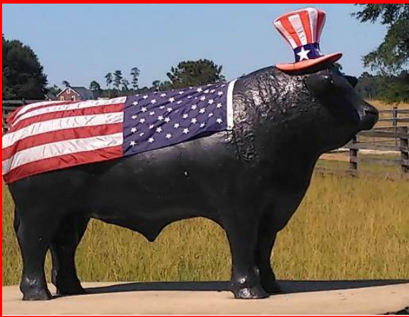
Home of the Bull!

Add Ground Beef, Briskets, Dino Ribs, Steaks & Filets to your order.